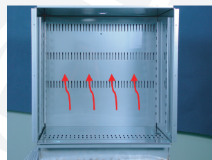
NATURAL CONVECTION OVEN